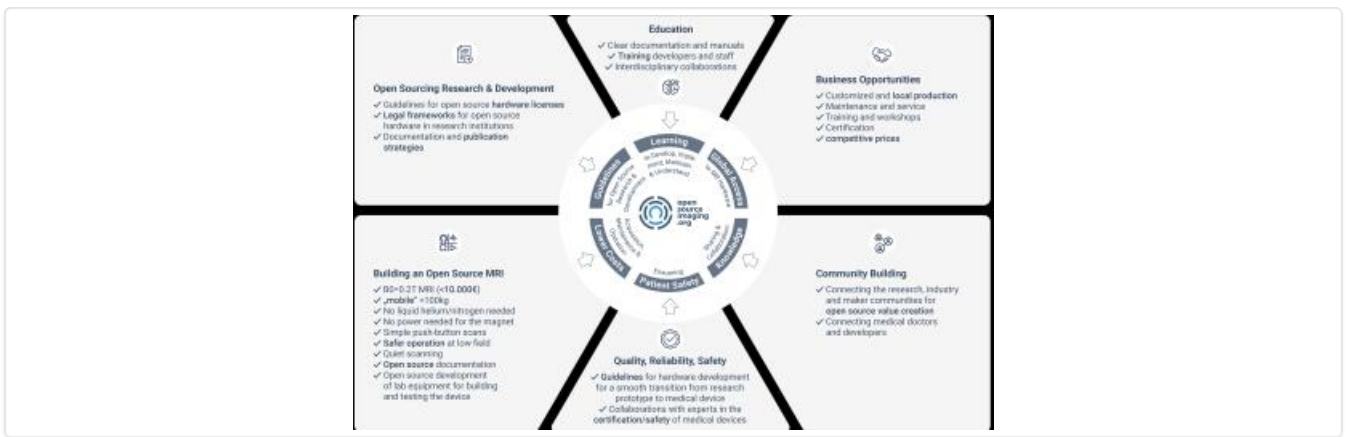
Figure 1 - Illustration of the six goals of the open source imaging initiative (OSI 2 ): Open Source Hardware Development, Guidelines for Open Source Research and Development, Community Building, Quality/Reliability/Safety, Education and Distribution.