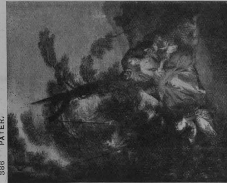
THE SWING. 6 in., 12 in., 15 in.