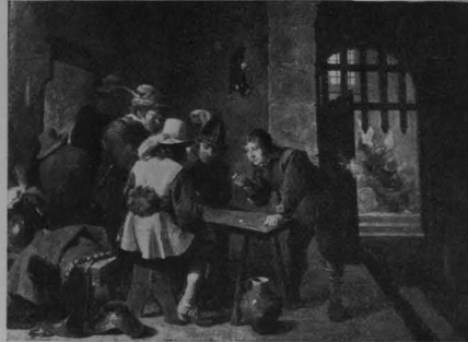
THE DELIVERANCE OF S. PETER. 6 in., 12 in.