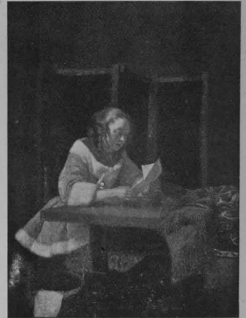
A LADY READING A LETTER. 6 in., 12 in.