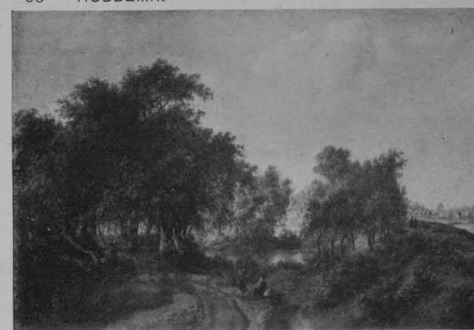
WOODED LANDSCAPE. 6 in., 12 in.