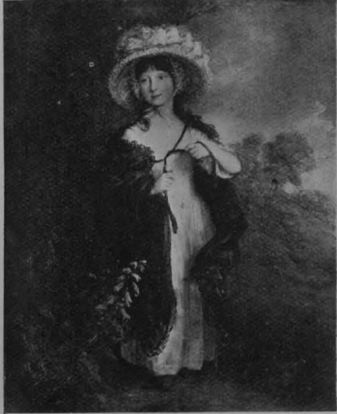
PORTRAIT OF MISS HAVERFIELD. 6 in., 12 in., 15 in., 20 in.