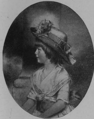
PORTRAIT OF A CHILD. 6 in., 12 in.