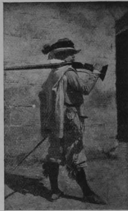
A MUSKETEER. TIME OF LOUIS XIII. 6 in., 12 in., 15 in., 20 in.