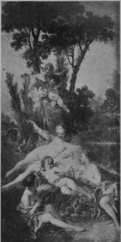
CUPID A CAPTIVE. 6 in., 12 in., 15 in., 20 in.