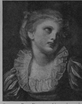
GIRL IN A BLUE DRESS. 6 in., 12 in., 15 in.