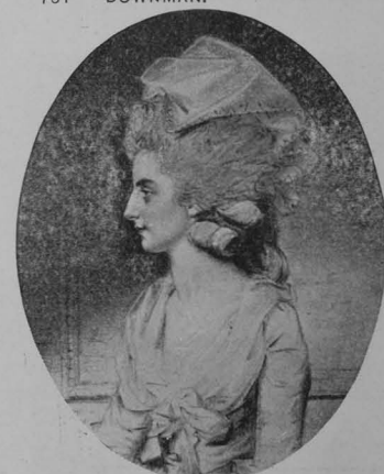
PORTRAIT OF A YOUNG LADY. 6 in., 12 in.