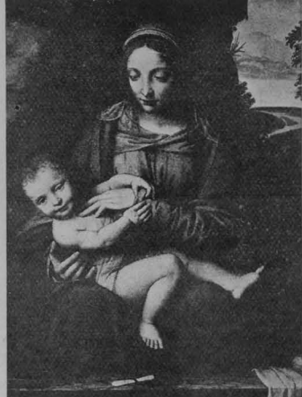
THE VIRGIN AND CHILD. 6 in., 12 in., 15 in.