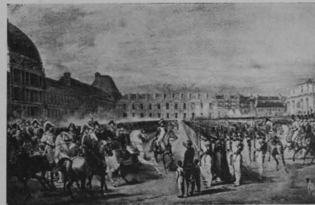
EMPEROR NAPOLEON REVIEWING TROOPS AT THE TUILERIES. 12 in.