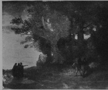
MACBETH AND THE WITCHES. 12 in.