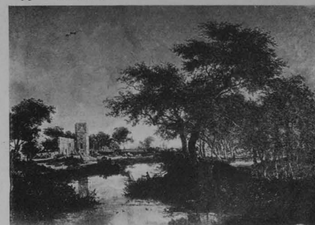
LANDSCAPE WITH A RUIN. [12 in.]