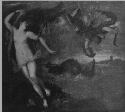
PERSEUS AND ANDROMEDA. 6 in., 12 in.