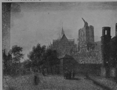
A STREET SCENE. 12 in.