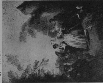
BLIND MAN'S BUFF. 6 in., 12 in., 15 in.