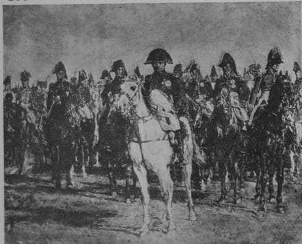
NAPOLEON I. AND HIS STAFF. 6 in., 12 in.