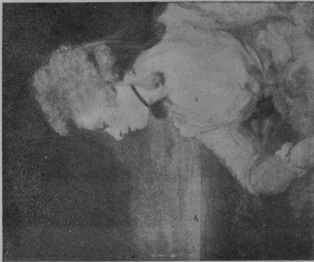
MRS. ROBINSON. 6 in., 12 in., 15 in., 20 in.