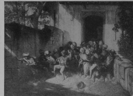
RELEASED FROM SCHOOL. 6 in., 12 in., 15 in.