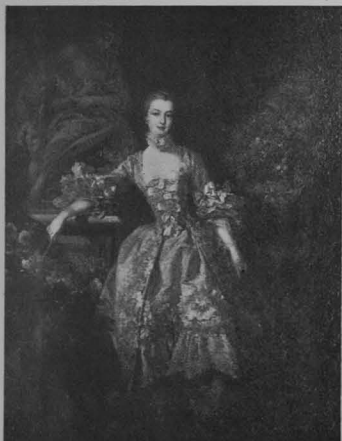
MADAME POMPADOUR. 6 in., 12 in., 15 in.