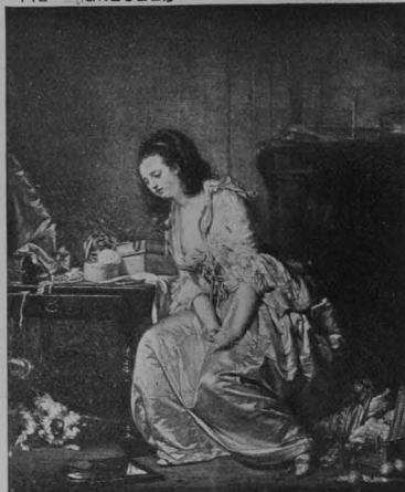
THE BROKEN MIRROR. 6 in., 12 in., 15 in.