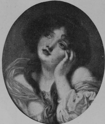
GIRL LEANING ON HER HAND. 6 in., 12 in., 15 in.