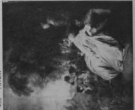
CONVERSATION GALANTE. 6 in., 12 in., 15 in.