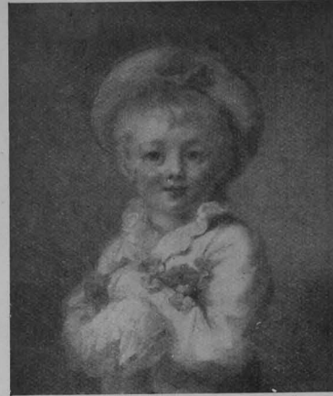
FAIR-HAIRED CHILD. 6 in., 12 in., 15 in., 20 in.