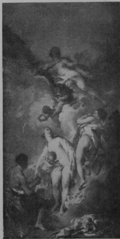
THE JUDGMENT OF PARIS. 6 in., 12 in., 15 in.