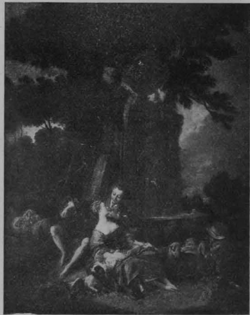
A PASTORAL. 6 in., 12 in., 15 in.