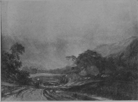
LANGDALE PIKES, WESTMORELAND.