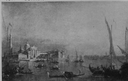
THE CHURCH OF SAN GIORGIO MAGGIORE. 6 in., 12 in.