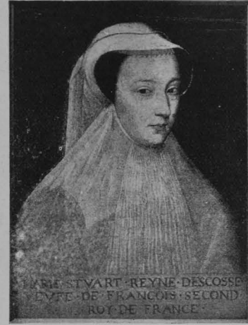
MARY QUEEN OF SCOTS. 6 in., 12 in.