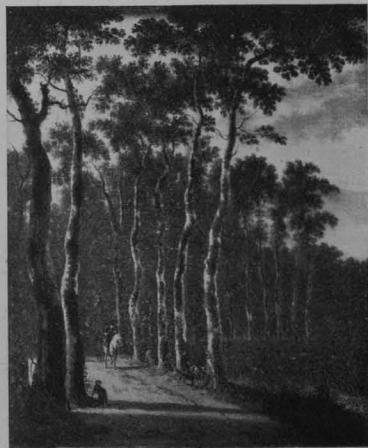
AVENUE IN A WOOD. 6 in., 12 in.