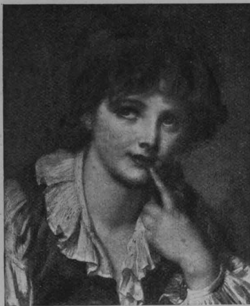
ESPIEGLERIE. 6 in., 12 in., 15 in., 20 in