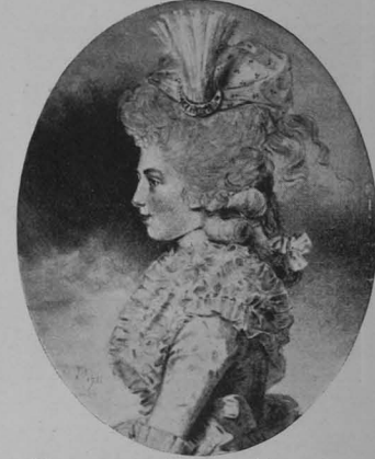
PORTRAIT OF A LADY. 6 in., 12 in.