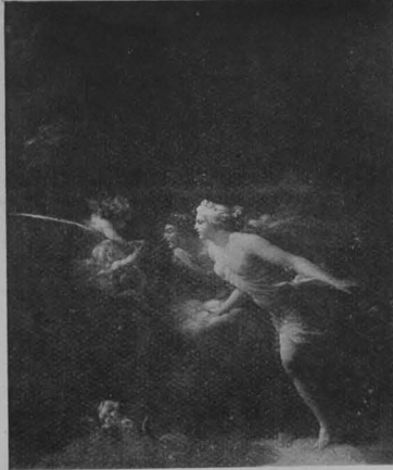
THE FOUNTAIN OF LOVE 6 in. 12 in., 15 in., 20 in.