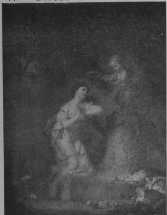
OFFERING TO CUPID. 6 in., 12 in., 15 in.