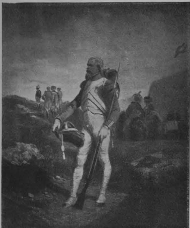
A GRENADIER. 12 inches.