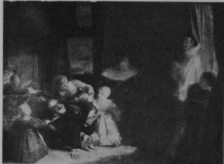
HENRY IV. AND THE SPANISH AMBASSADOR. 6 in., 12 in., 15 in.