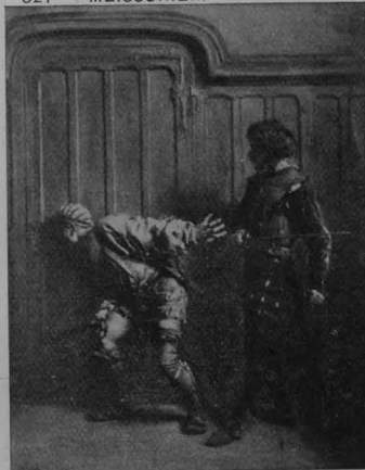
THE BRAVOS. 6 in., 12 in.