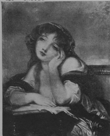
THE LETTER WRITER. 6 in., 12 in.