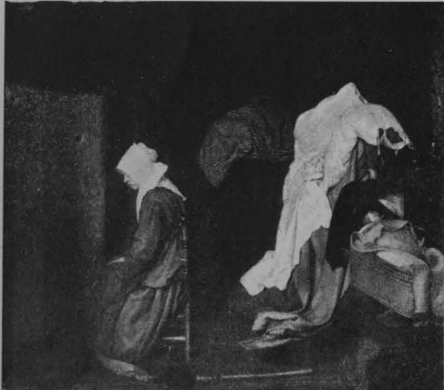
INTERIOR. WOMAN COOKING. 12 in.