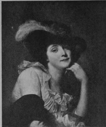
PORTRAIT OF MLE. SOPHIE ARNOULD. 6 in., 12 in., 15 in., 20 in.