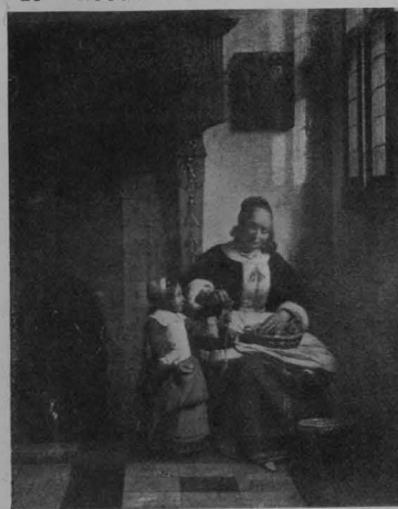
INTERIOR, WITH A WOMAN PEELING APPLES. 6 in., 12 in., 15 in.