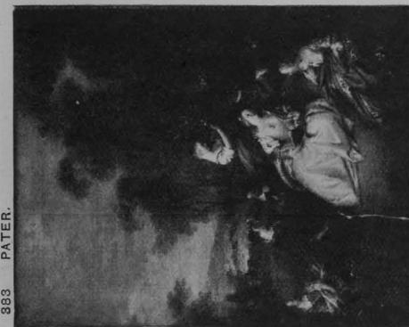
FETE CHAMPETRE. 6 in., 12 in., 15 in.