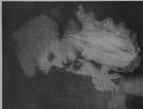
LADY F. SEYMOUR. 6 in., 12 in., 15 in., 20 in.