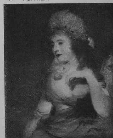
PORTRAIT OF A LADY. 6 in., 12 in.