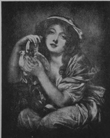
GIRL WITH DOVES. 6 in., 12 in., 15 in., 20 in.