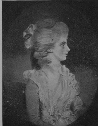
PORTRAIT OF A YOUNG LADY. 6 in., 12 in.