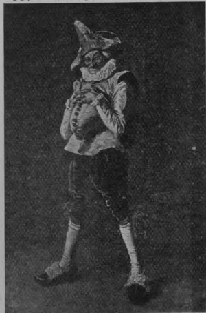
POLICHINELLE. 6 in., 12 in., 15 in.