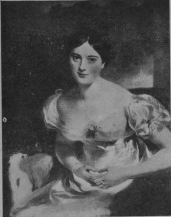
PORTRAIT OF LADY BLESSINGTON. 6 in., 12 in., 15 in.