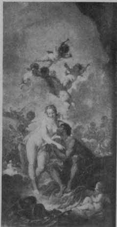
THE VISIT OF VENUS TO VULCAN. 6 in., 12 in., 15 in.