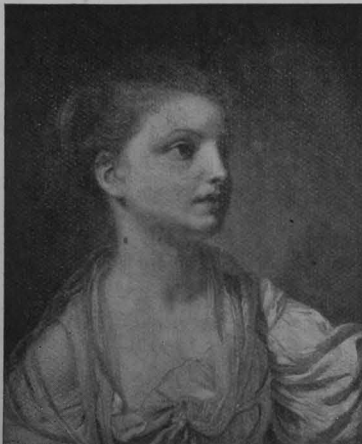
GIRL IN A WHITE DRESS 6 in., 12 in., 15 in.