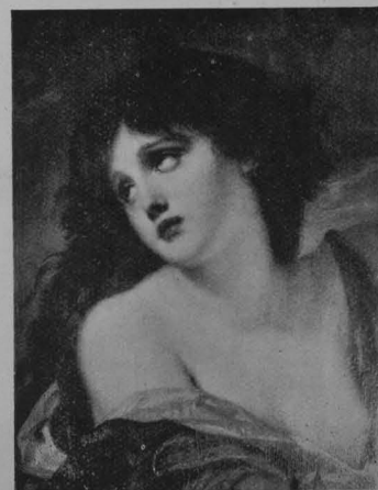
STUDY OF GRIEF. 6 in., 12 in., 15 in., 20 in.