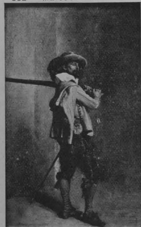
A MUSKETEER. TIME OF LOUIS XIII. 6 in., 12 in., 15 in., 20 in.