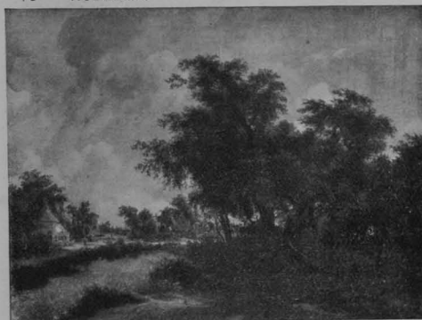
STORMY LANDSCAPE. 6 in., 12 in.