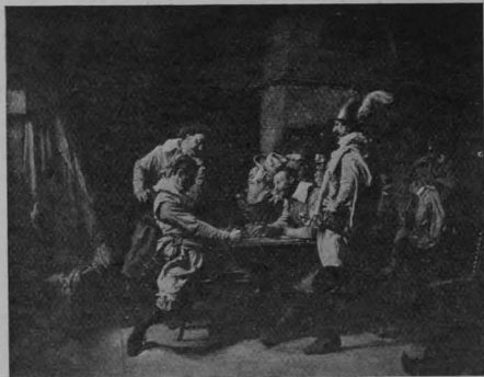
SOLDIERS GAMBLING. 6 in., 12 in.