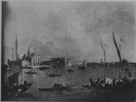
THE CHURCH OF SAN GIORGIO MAGGIORE. 12 in.