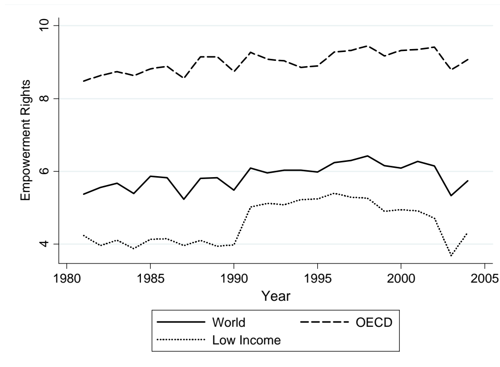
Figure 2: Development of empowerment rights over time

Figure 2 shows the development of empowerment rights. As can be seen, the average level of empowerment rose steadily over the period of observation (except in 2003), with similar developments in developing and OECD countries. The most substantial increase in empowerment was experienced in 1990, particularly in low income countries. 27 The index mean is 4.6 for low income countries, more than 9 in OECD countries, and 5.9 for the world sample. Since 1996 we observe a negative trend in low-income countries, which started to reverse at the end of the sample period. The world sample contains 130 countries in 1981 and 181 in 2004.